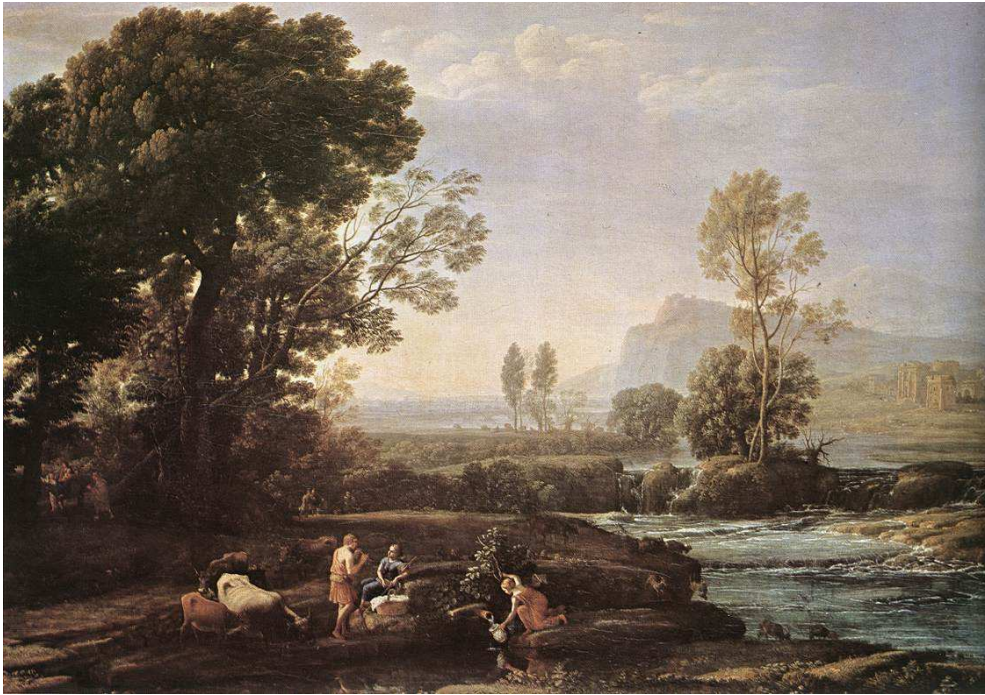
Claude Lorrain (1600-1682) Flight to Egypt