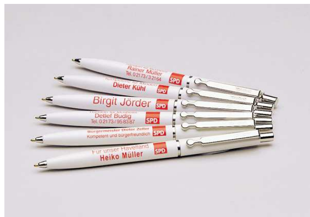
Souvenirs with "non-souvenir" objectives