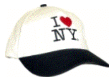
Souvenirs with several objectives