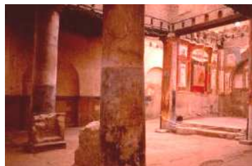
Holiday villa near Pompeii for rich Romans