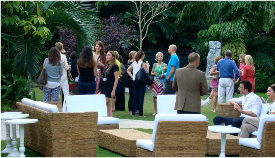
Source: Michy's Miami Beach Pop up, Courtesy of Chef Michelle Bernstein's Facebook page

interactive installations set up inside some of the area's bars. In 2014, the Nova Bar featured the exhibit 'Dancarchy Refuge' by artist Naomi Fisher. Visitors escaped from the crowds by strolling through a path lined with large green plants leading to a room with colorful tie-dyed paintings where ballerinas performed a short routine.